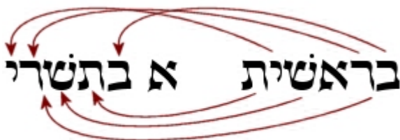
on the 1st of Tishri

The Mishnah (Sanhedrin 38b) states that Adam and Chavah were created on Rosh Hashanah (i.e., Tishri 1). But how did the sages determine this date? By transposing the Hebrew letters of the very first word of the Hebrew Scriptures: