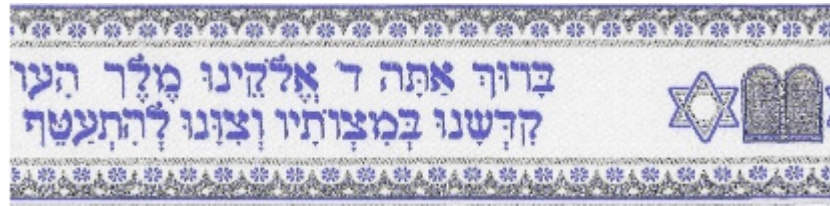
The blessing embroidered upon the atarah

Next, put the tallit on and recite (or read the blessing as written on the atarah):